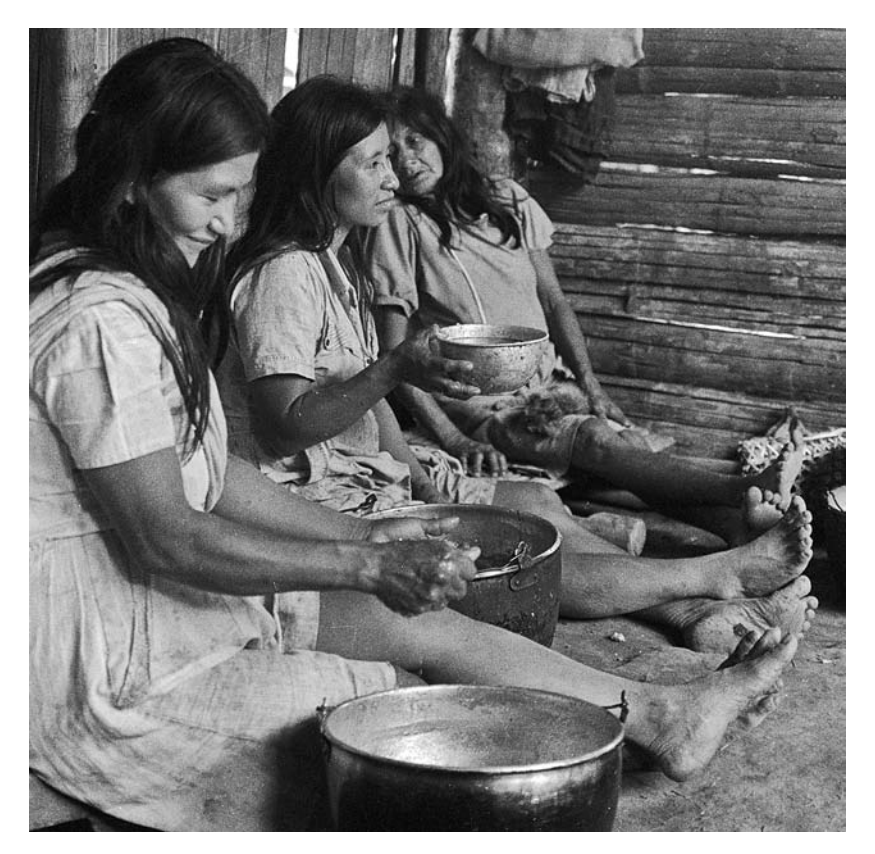
FIGURE 3. Drinking beer.

with Runa hunters, others when I was left alone in the forest, sometimes for hours, as these hunters ran off in pursuit of their quarry—quarry that sometimes ended up circling back on me. Still others occurred during my slow strolls at dusk in the forest just beyond the manioc gardens that surround people's houses where I would be privy to the last burst of activity before so many of the forest's creatures settled down for the night.